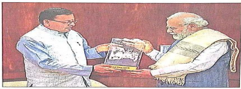
M Dhami with Prime Minister Modi in Delhi on Monday.